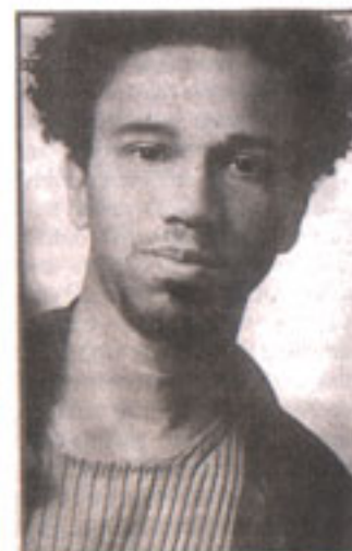
Aaron McGruder Cartoonist